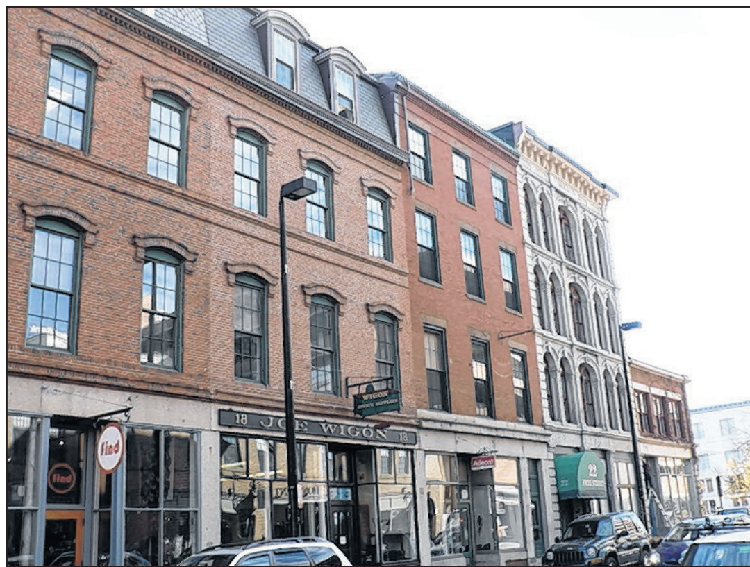
J.B. Brown's downtown Portland purchase along this historic stretch of Free Street east of Center Street totals 71,000 square feet of retail and office space.